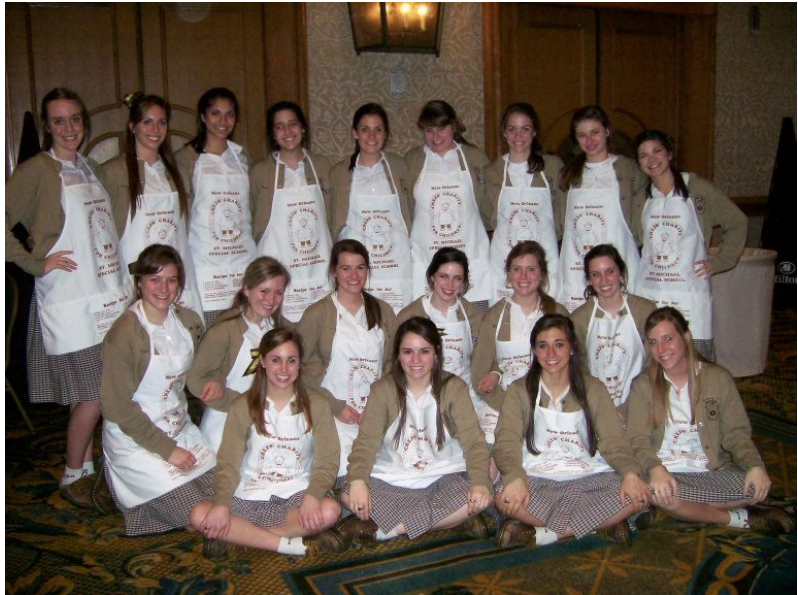
On March 22, Mount Carmel students volunteered at St. Michael Special School's Chef's Charity at Hilton Riverside.