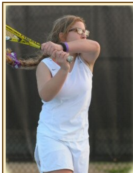
The tennis team has been winning matches across the State.